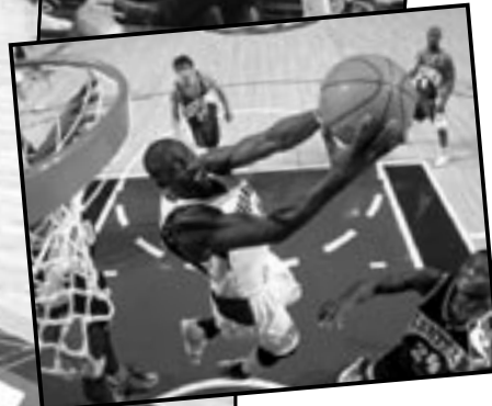
Buck Williams had his No. 52 jersey retired by the Nets on April 11, 1999.