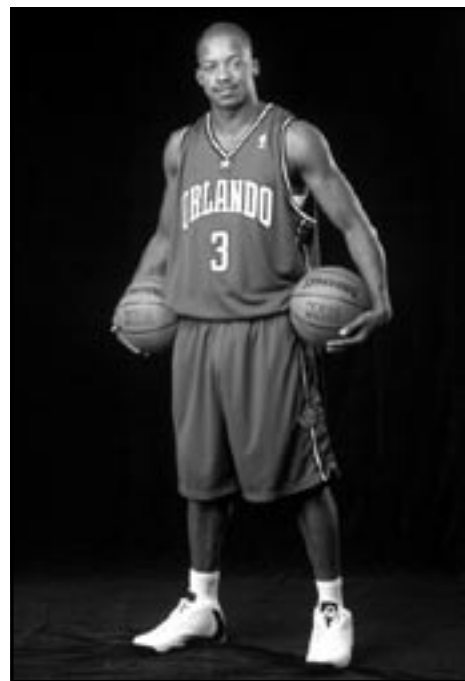
No. 2 overall selection in 1999, Steve Francis was traded from the Houston Rockets to the Orlando Magic in 2004.