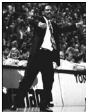
John Lucas was named Cleveland Cavaliers head coach on June 19, 2001.