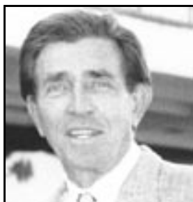
Gene Shue was named NBA Coach of the Year twice in 1969 and 1972