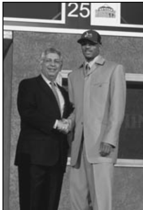
Juan Dixon with NBA Commissioner David Stern at the 2002 Draft.